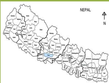
Palpa District is indicated in blue.