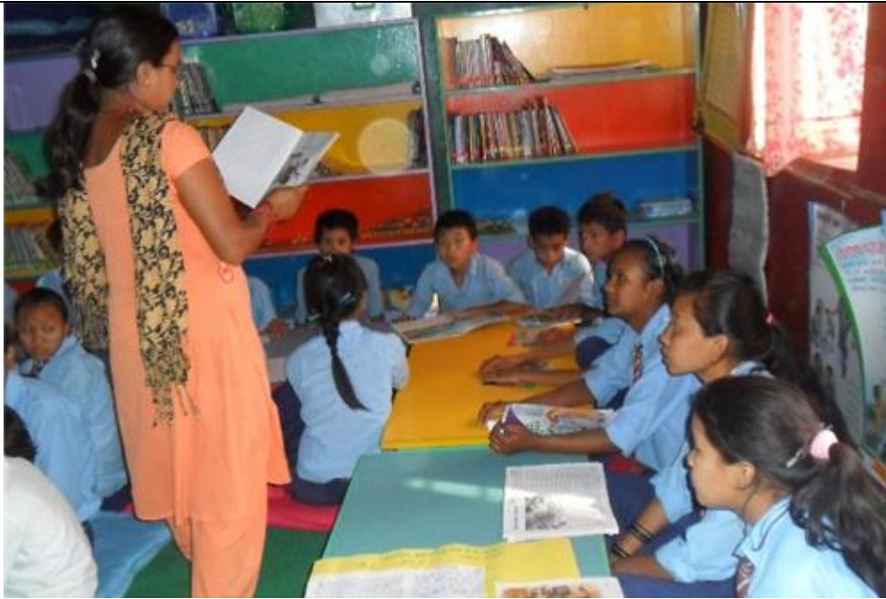
Teacher conducting library activities.