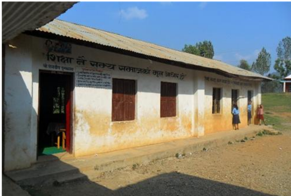
Exterior view of school building in which library is located.