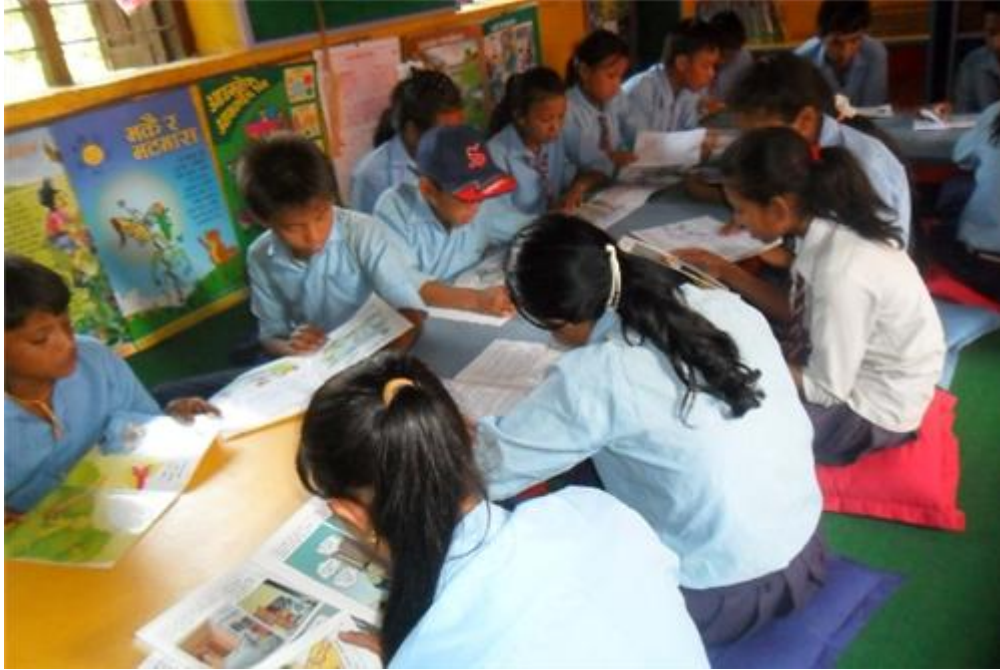
Children reading in the library during library period.