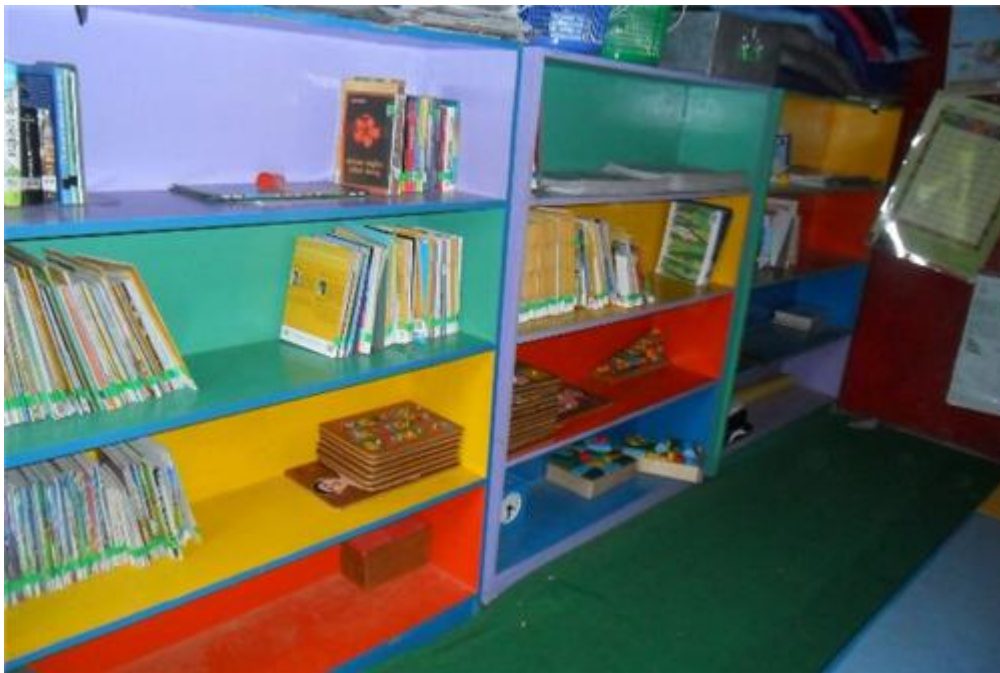
Books and materials displayed inside the library.