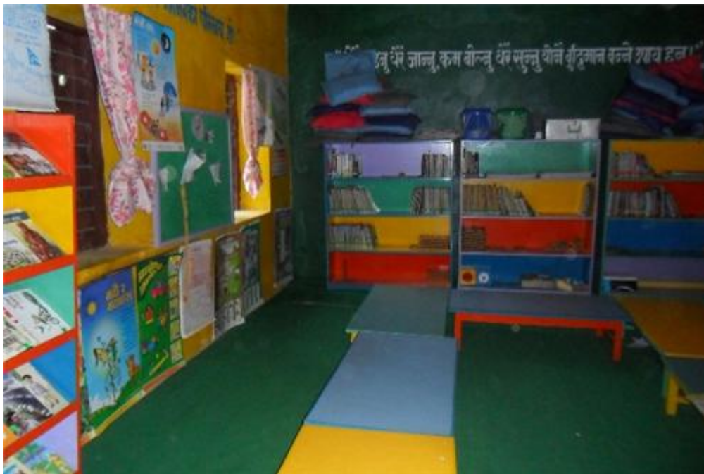
Library books, furniture, and materials on display inside the library.