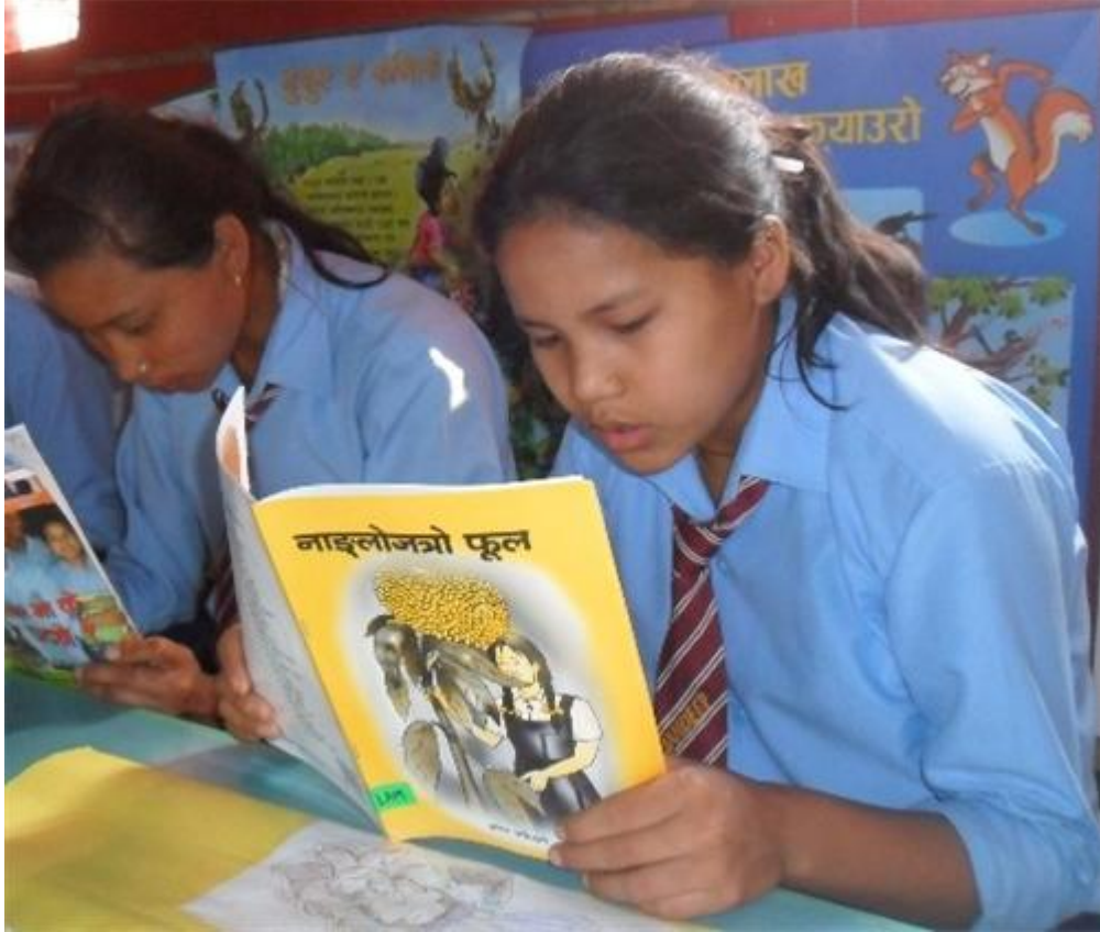
Close-up of a child reading a book in the library.